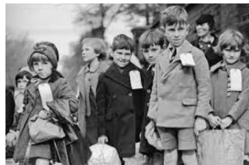
Secrets and Spies Day at Coeshill (Approximate cost £8)